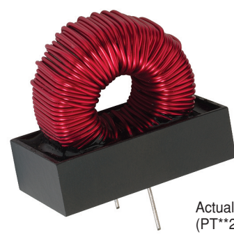
Actual Size (PT**25-894VM)