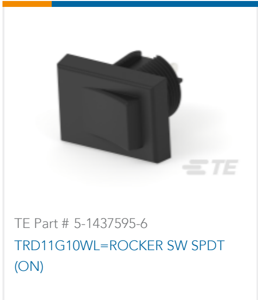
TE Part # 5-1437595-6 TRD11G10WL=ROCKER SW SPDT (ON)