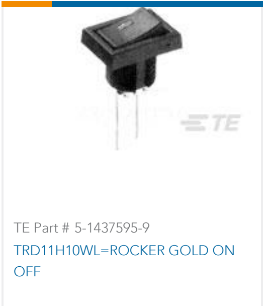
TE Part # 5-1437595-9 TRD11H10WL=ROCKER GOLD ON OFF