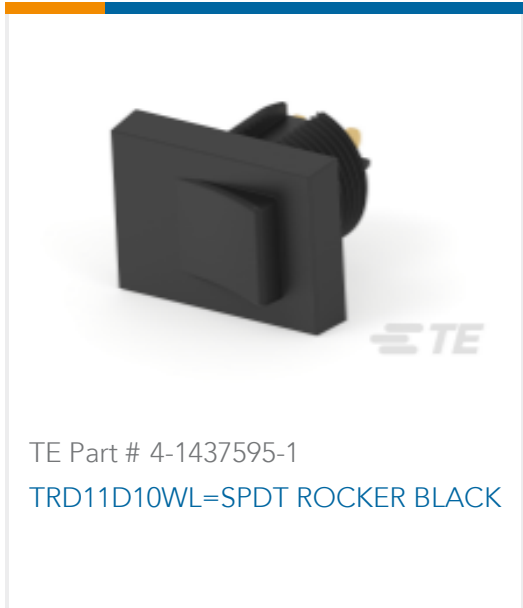
TE Part # 4-1437595-1 TRD11D10WL=SPDT ROCKER BLACK