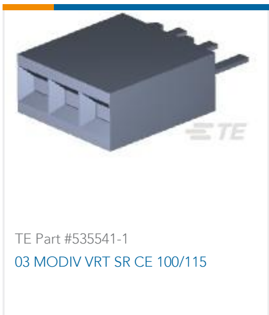
TE Part #535541-1 03 MODIV VRT SR CE 100/115