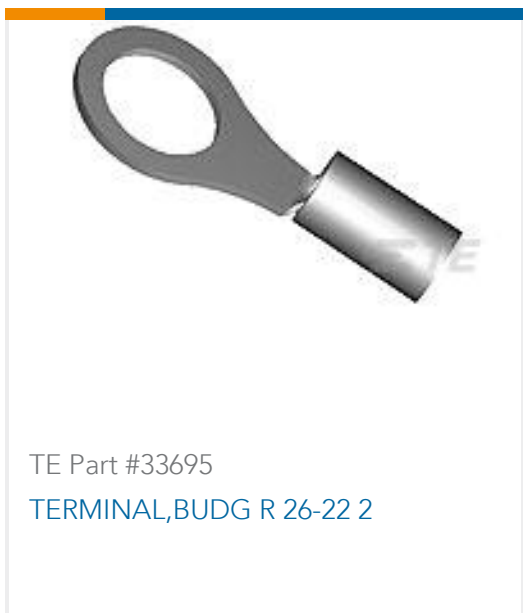
TE Part #33695 TERMINAL,BUDG R 26-22 2