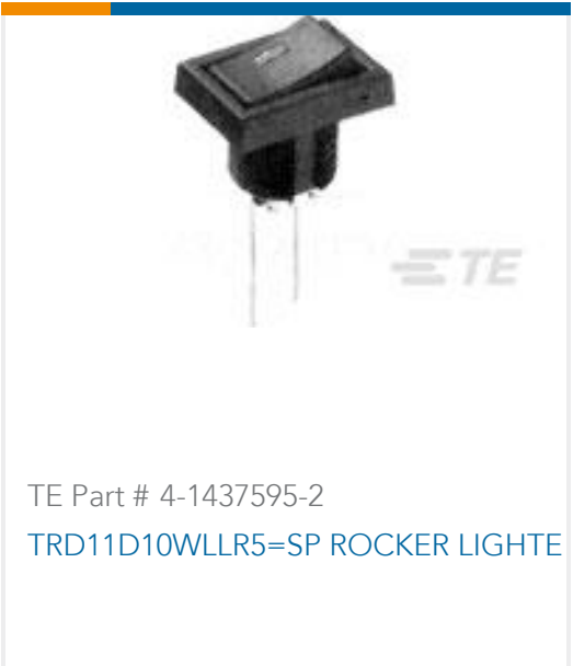
TE Part # 4-1437595-2 TRD11D10WLLR5=SP ROCKER LIGHTE