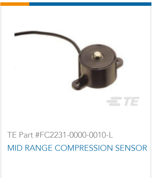
TE Part #FC2231-0000-0010-L MID RANGE COMPRESSION SENSOR