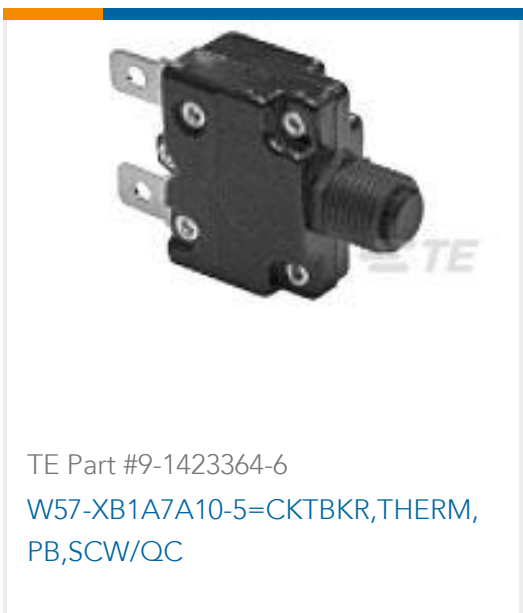
TE Part #9-1423364-6 W57-XB1A7A10-5=CKTBKR,THERM, PB,SCW/QC