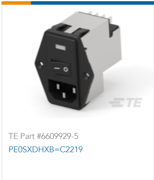
TE Part #6609929-5 PE0SXDXHB=C2219