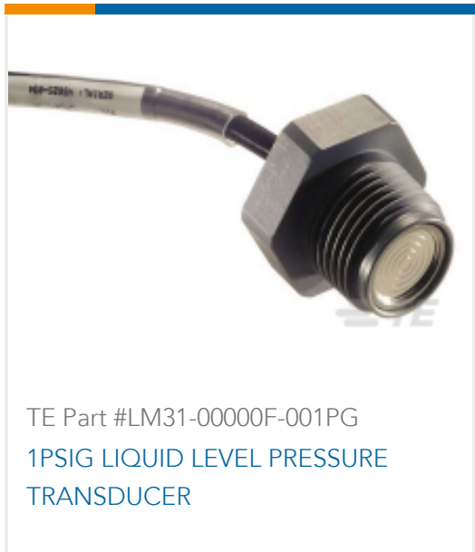
TE Part #LM31-00000F-001PG 1PSIG LIQUID LEVEL PRESSURE TRANSDUCER