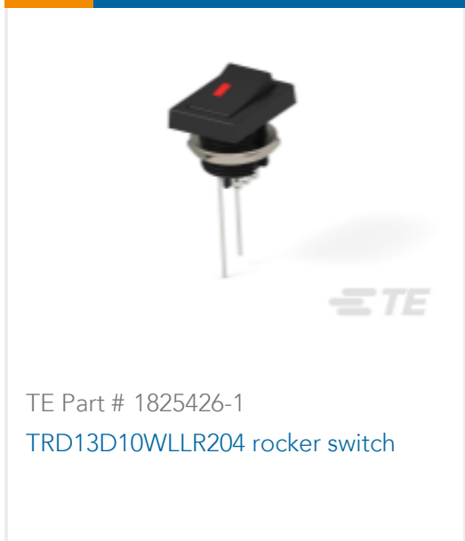
TE Part # 1825426-1 TRD13D10WLLR204 rocker switch