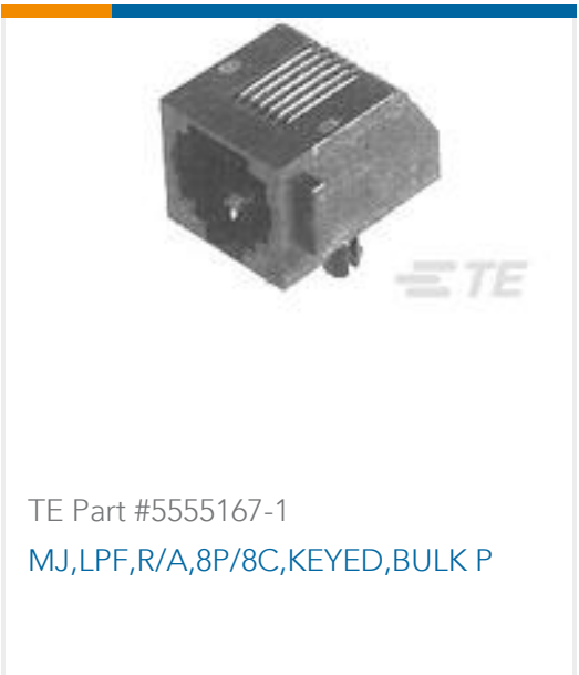
TE Part #5555167-1 MJ,LPF,R/A,8P/8C,KEYED,BULK P