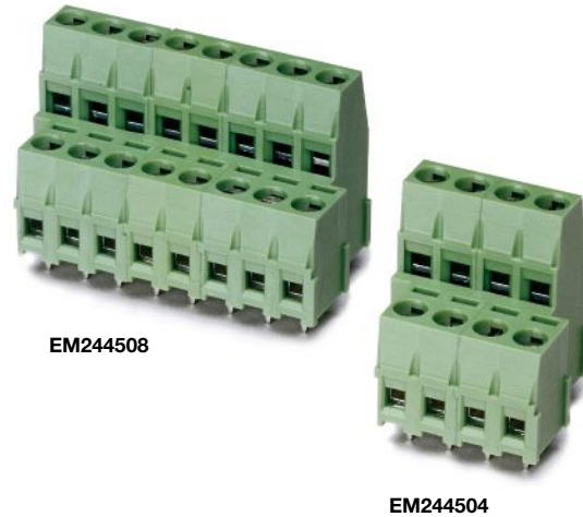
Dimensions - in (mm)

Agency Information: File E62622; CE Certified