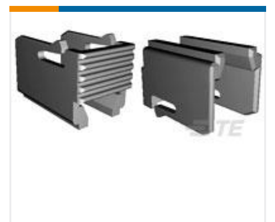
TE Part #965383-1 MQS SICHERGSCHIEBER 8POS