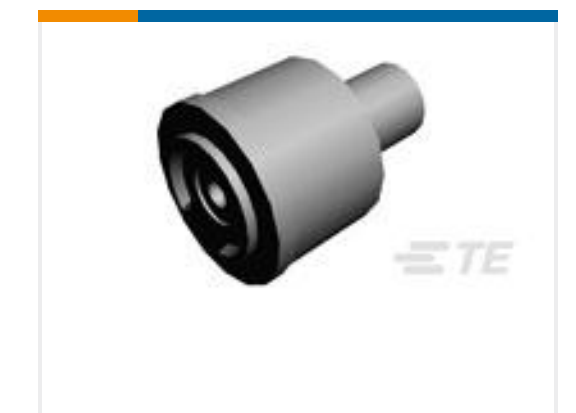
TE Part #284863-1 SINGLE WIRE SEAL F.EXT.INS.DIA