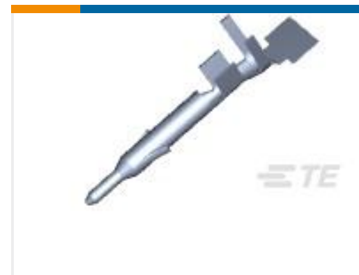
TE Part #770903-1 MINI UMNL PIN 22-18 AWG SN