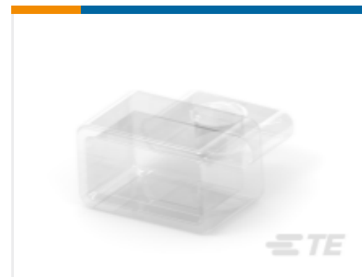
TE Part # 2834268-1 PROTECTION COVER,MINIATURE CONN, PLUG