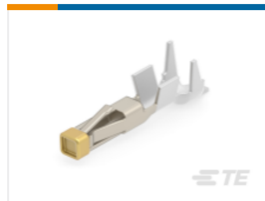
TE Part # 1-2834067-3 SOCKET CONTACT,MINIATURE WATERPROOF CONN