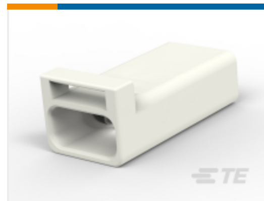
TE Part #1-2834075-2 2P REC, MINIATURE WATERPROOF CONN.WHITE