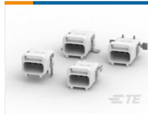
TE Part # CAT-SL36-M6642B Miniature Headers, SlimSeal