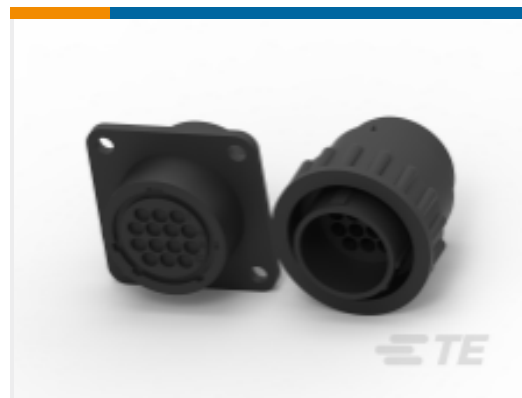
TE Part #183039-1 CPC EMEA