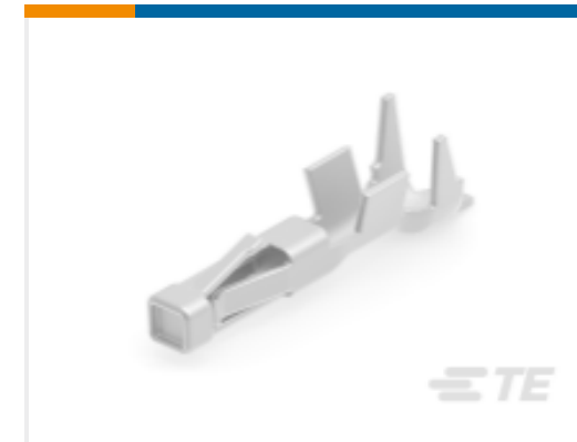
TE Part # 2-2834067-2 SOCKET CONTACT,MINIATURE WATERPROOF CONN