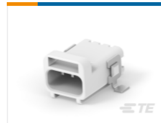
TE Part #1-2834236-1 3P REC, IP67 R/A SMT CONN,NATURE