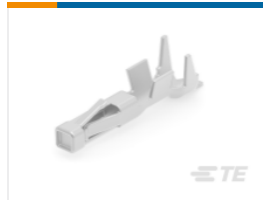
TE Part # 1-2834067-2 SOCKET CONTACT,MINIATURE WATERPROOF CONN