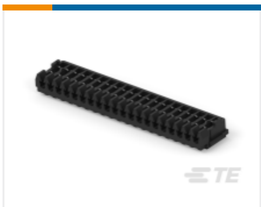
TE Part #4-353293-0 1.5MM CT MT REC ASSY 20P BLACK