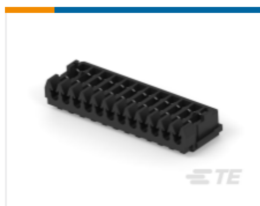
TE Part #3-353293-2 1.5MM CT MT REC ASSY 12P BLACK