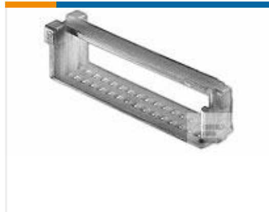
TE Part #2-353294-2 AMP MINI D/R HDR HSG 22P NATU