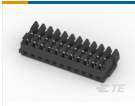
TE Part #3-353293-1 1.5MM CT MT REC ASSY 11P BLACK