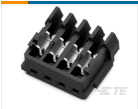
TE Part #2-353293-4 1.5MM CT MT REC ASS'Y 4P BLACK