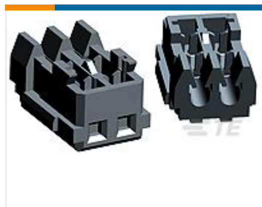
TE Part #353293-6 MINI CT MT REC ASSY 6P GRAY