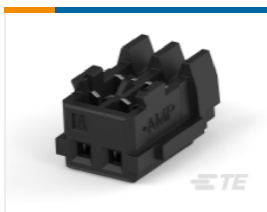
TE Part #2-353293-2 1.5MM CT MT REC ASS'Y 2P BLACK