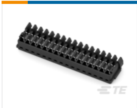
TE Part #3-353293-6 1.5MM CT MT REC ASSY 16P BLACK