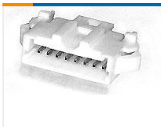
TE Part #292215-7 MINI CT SGL RELAY 7P NAT