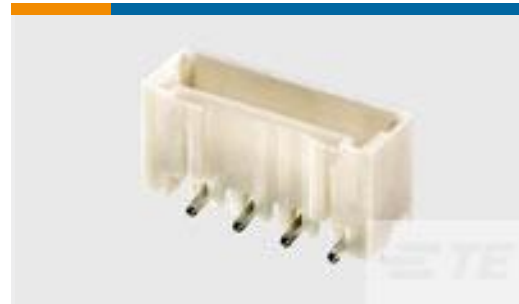
TE Part #1-292231-1 1.5 MINI CT SGL V SMT W/O BOSS