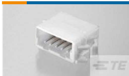
TE Part #292254-2 CT RELAY HDR ASSY 2P NAT