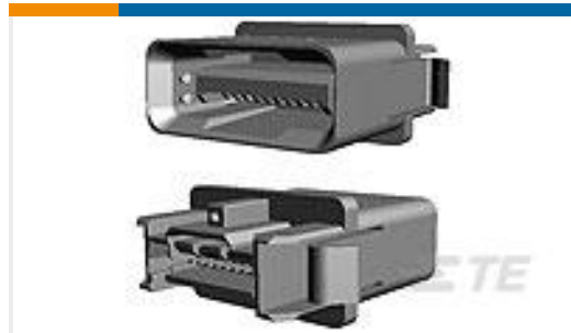
TE Part #1-1612257-4 REC ASSY 14P, MINI CT DC DRAW