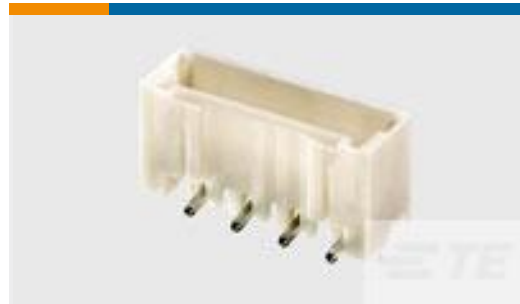
TE Part #1-292230-1 1.5 MINI CT SGL V SMT W/BOSS 1