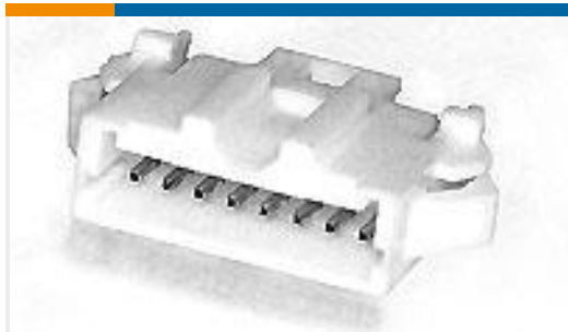
TE Part #292215-5 MINI CT SGL RELAY 5P NAT