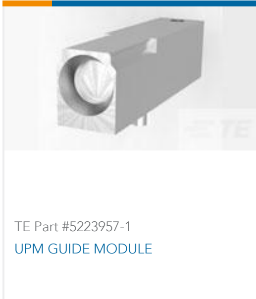
TE Part #5223957-1 UPM GUIDE MODULE