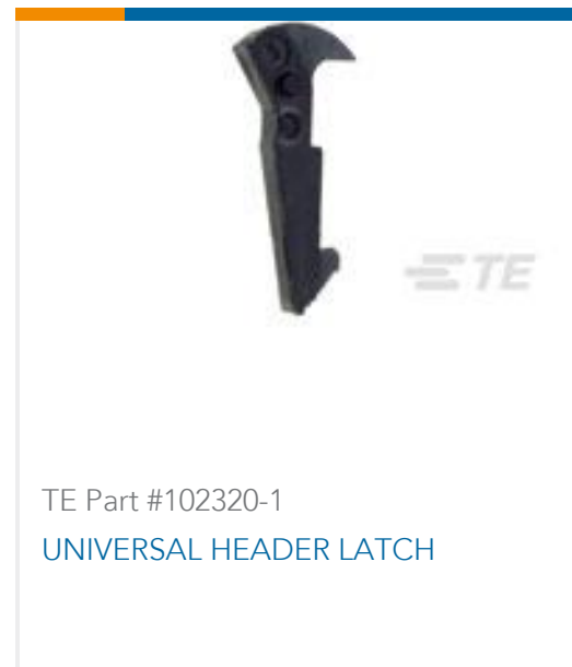
TE Part #102320-1 UNIVERSAL HEADER LATCH