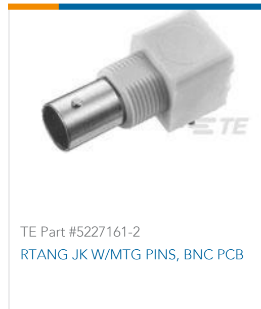
TE Part #5227161-2 RTANG JK W/MTG PINS, BNC PCB