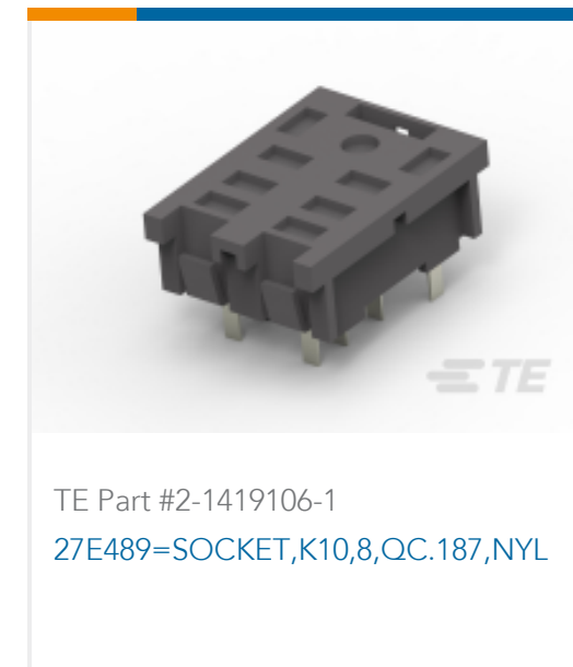
TE Part #2-1419106-1 27E489=SOCKET,K10,8,OC.187,NYL