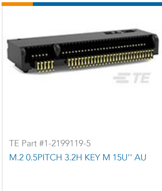
TE Part #1-2199119-5 M.2 0.5PITCH 3.2H KEY M 15U" AU