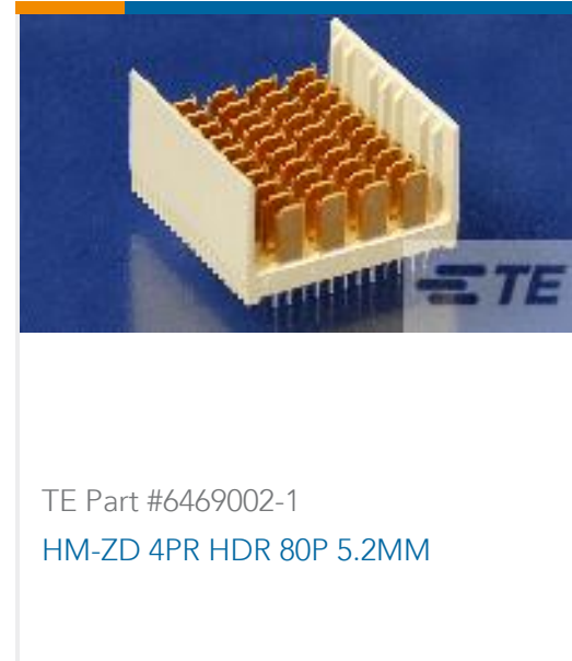
TE Part #6469002-1 HM-ZD 4PR HDR 80P 5.2MM