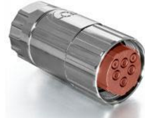
Contact Arrangement mating view

C ST A 263 NN 00 25 0001 000 C S A 263 N 00 25 0001 000