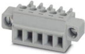
The figure shows a 5-pos. version of the product in gray

Plug component, Nominal current: 8 A, Rated voltage (III/2): 160 V, Number of positions: 20, Pitch: 3.81 mm, Connection method: Screw connection, Color: pastel green, Contact surface: Tin