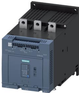
SIRIUS soft starter 200-600 V 570 A, 110-250 V AC Spring-loaded terminals Analog output