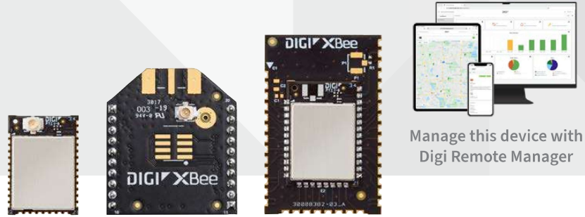
Manage this device with Digi Remote Manager