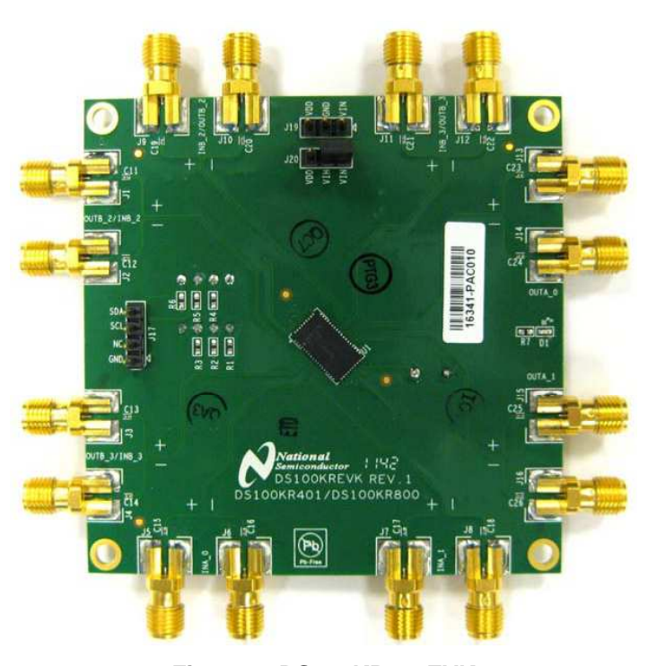
Figure 1. DS100KR401EVK (Top View)