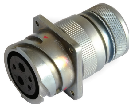
Blue Generation Plating (A240)