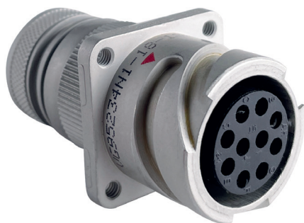
J Plating (A241)

ITT Cannon's Blue Generation Plating This ruggedized RoHS compliant industrial plating delivers an outstanding combination of extreme durability, conductivity and shielding performance. • Salt spray resistance: 500 hours • Shielding effect acc. VG 95373: >65 dB • Conductivity: <10 mOhm • Zinc nickel plating chemistry • RoHS and REACH compliant