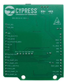
Figure 2: CYBT-423028-EVAL Bottom View

SW1: Reset Switch routed to the XRES connection on the module.