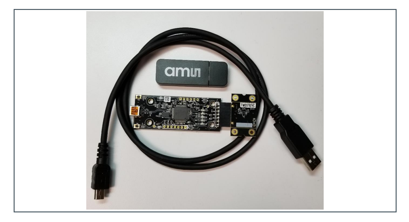
Figure 1: Evaluation Kit Contents

Each TMD3702VC Evaluation Kit comes with the following components: