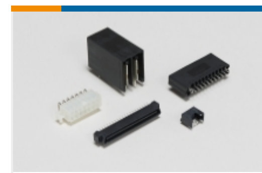
Standard Rectangular Connectors(336)