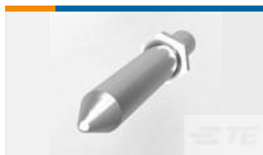
TE Part #223982-1 Stainless Steel Guide Pin M4x0.7