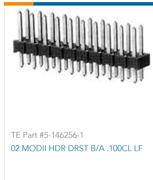
TE Part #5-146256-1 02 MODII HDR DRST B/A .100CL LF