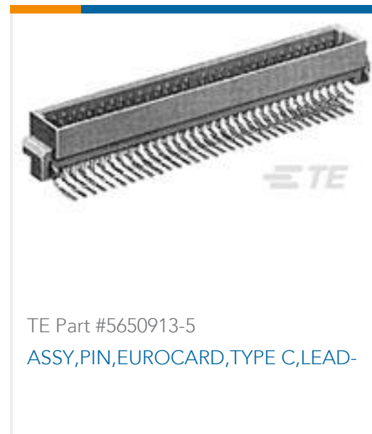
TE Part #5650913-5 ASSY,PIN,EUROCARD,TYPE C,LEAD-