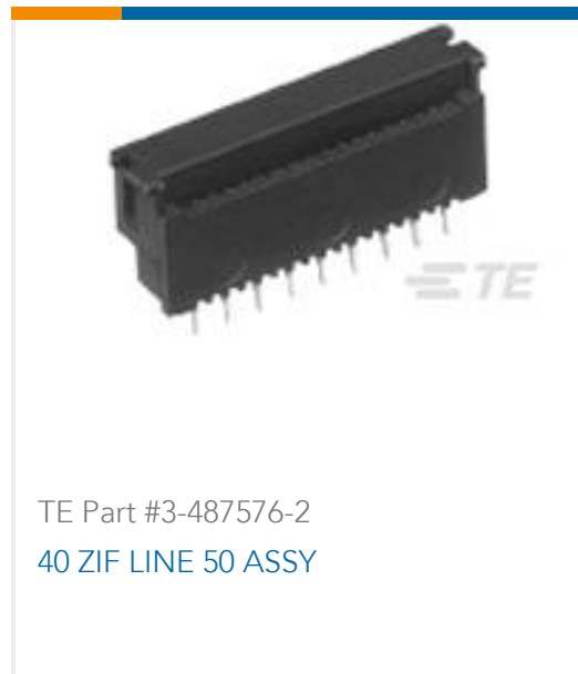
TE Part #3-487576-2 40 ZIF LINE 50 ASSY