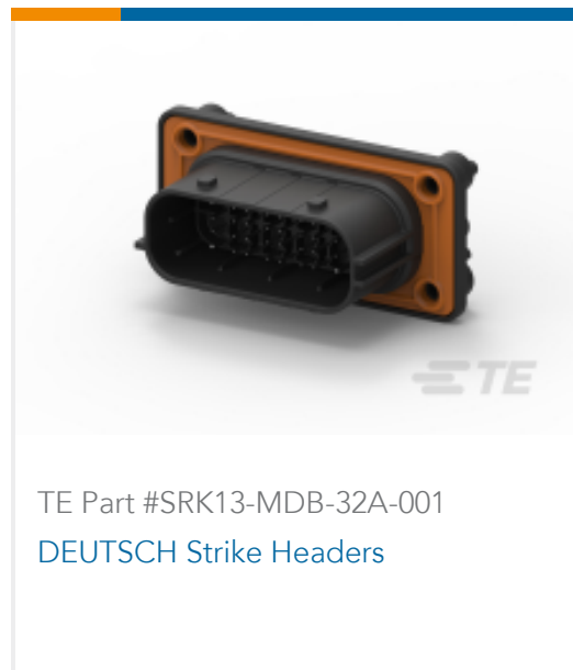
TE Part #SRK13-MDB-32A-001 DEUTSCH Strike Headers