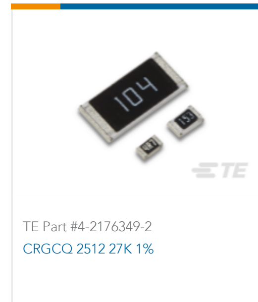
TE Part #4-2176349-2 CRGCO 2512 27K 1%