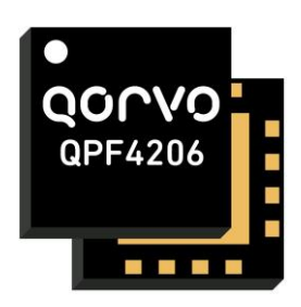
16 Pin 3x3 mm Laminate Package