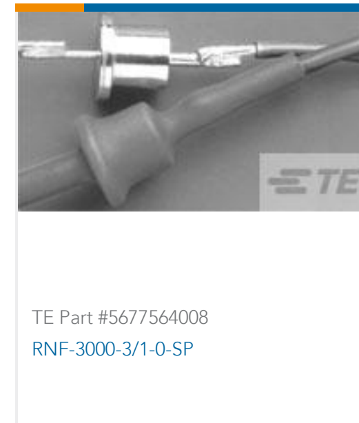
TE Part #5677564008 RNF-3000-3/1-0-SP