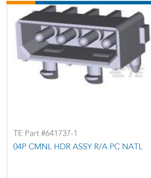
TE Part #641737-1 04P CMNL HDR ASSY R/A PC NATL