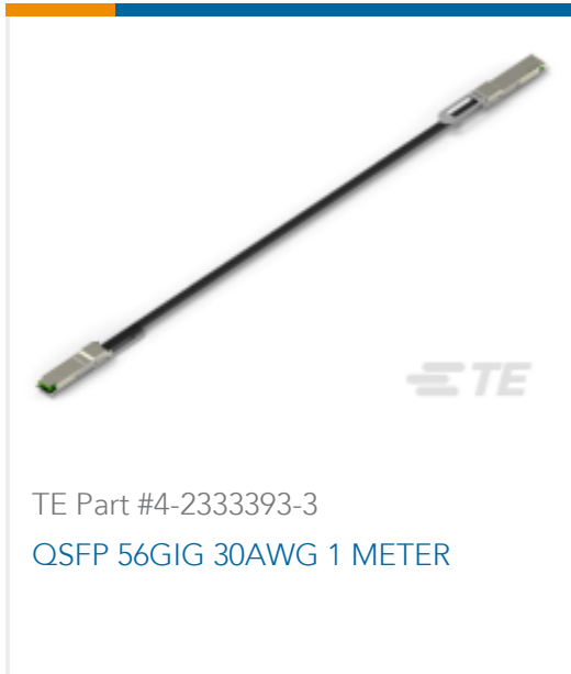
TE Part #4-2333393-3 QSFP 56GIG 30AWG 1 METER