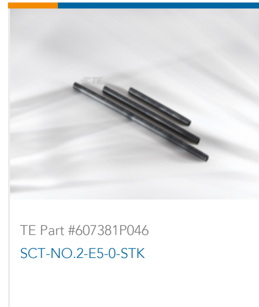
TE Part #607381P046 SCT-NO.2-E5-0-STK