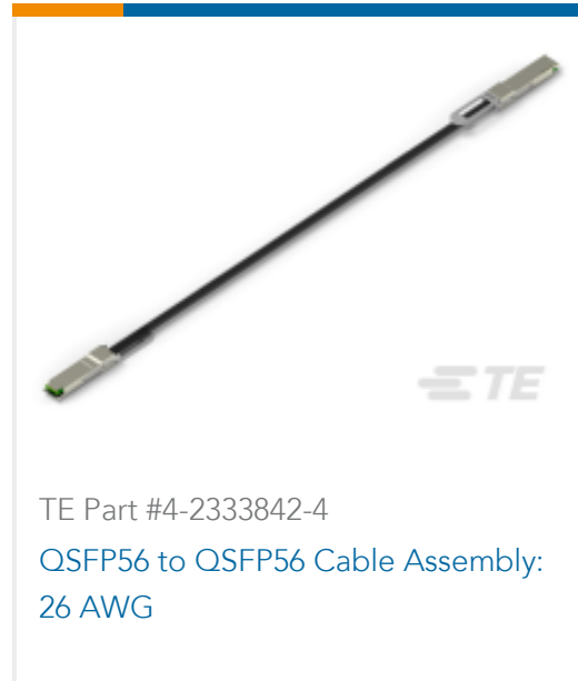
TE Part #4-2333842-4 QSFP56 to QSFP56 Cable Assembly: 26 AWG