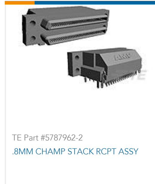
TE Part #5787962-2 .8MM CHAMP STACK RCPT ASSY