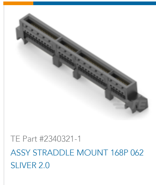
TE Part #2340321-1 ASSY STRADDLE MOUNT 168P 062 SLIVER 2.0