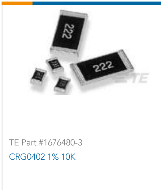
TE Part #1676480-3 CRG0402 1% 10K