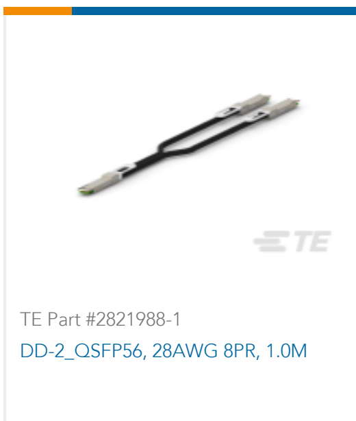
TE Part #2821988-1 DD-2_QSFP56, 28AWG 8PR, 1.0M