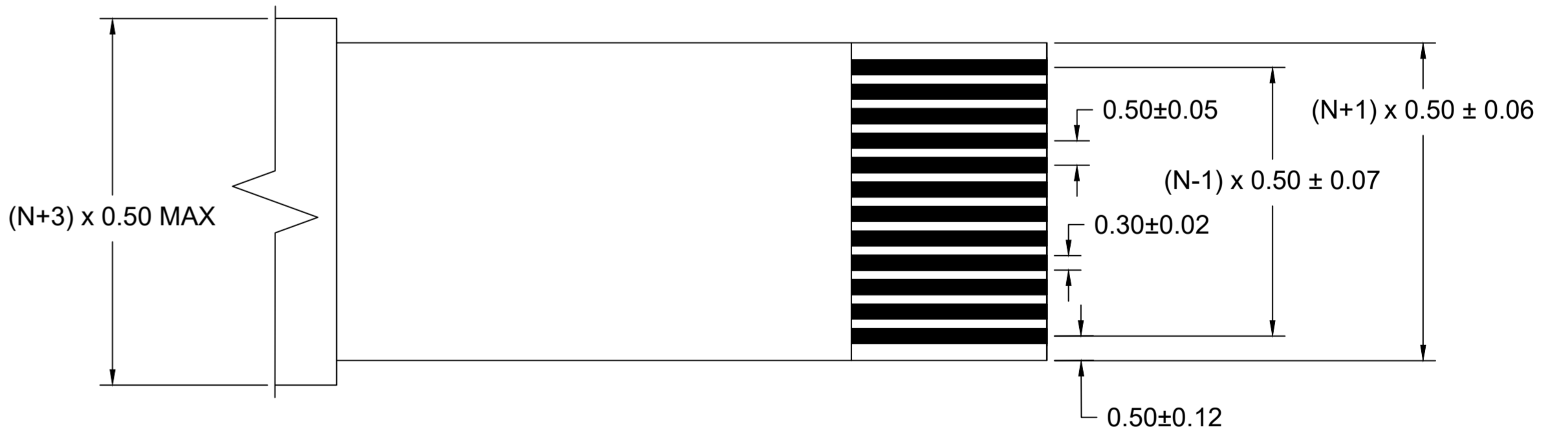
END-TAIL DIMENSIONS SCALE 10:1