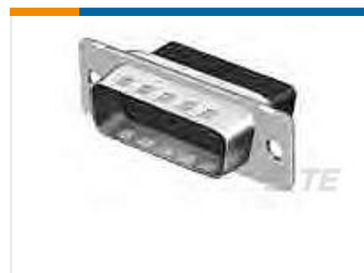
TE Part #167292-1 09P.HDP20 PLUG ASSY