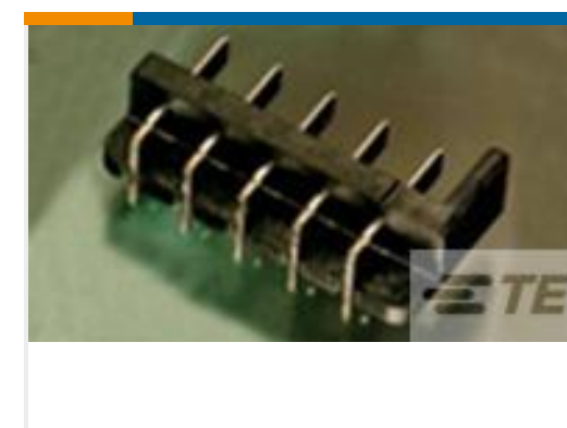
TE Part #5787422-1 HDR ASY,RA,RKEY,STR TAIL,12.0V