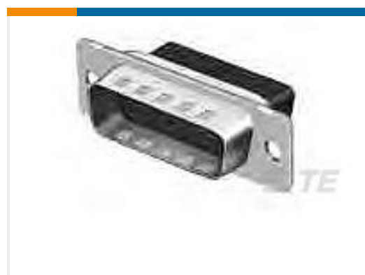
TE Part #167293-1 15P.HDP20 PLUG ASSY