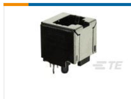
TE Part #6116202-1 MJ,TE,8P,COMPL.PIN,CAT5,PC