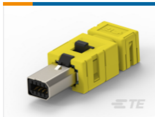
TE Part # CAT-IN291-M6641 Mini I/O Cable Conn. Piercing D1