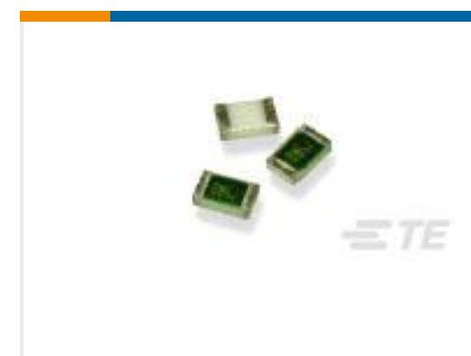
TE Part #2-1614884-6 CPF 0805 24R 0.1% 25PPM 1K RL