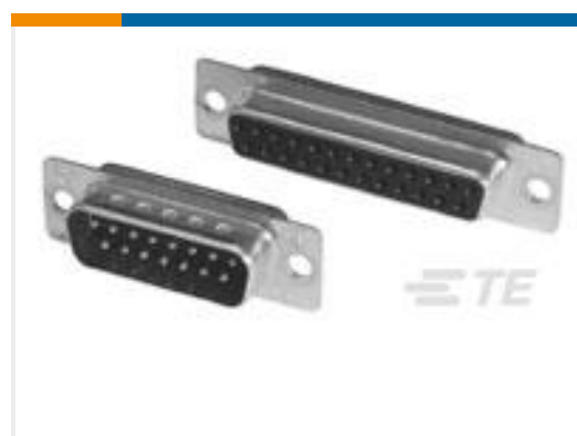
TE Part #4-1393483-8 V42254A1115C215=SUB D STIFTLI