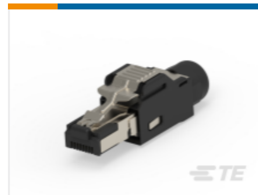
TE Part # 1903527-1 IE RJ45 CONNECTOR IP20 8POS 180DEG