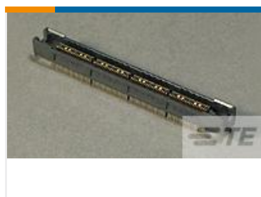
TE Part #5767044-4 MICTOR,R/A,RECPT,.062,152,ASY