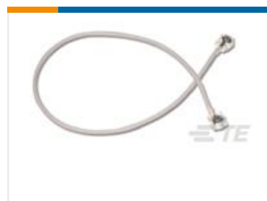
TE Part #2015357-4 C/A, UMCC/UMCC, 1.37 OD CABLE, 200MM LON