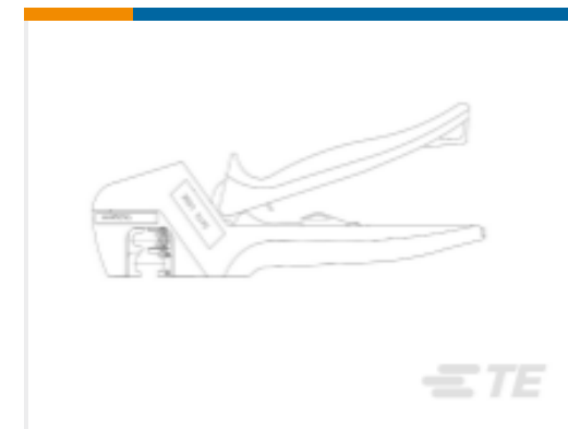
TE Part # 2229737-2 MINI I/O PIERCING TYPE HAND TOOL 180DEG