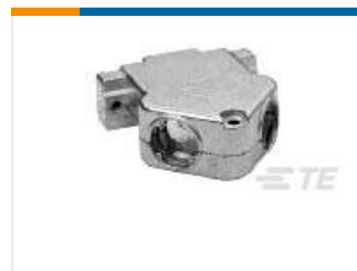
TE Part #1534807-1 HD20 COVER KIT 15P