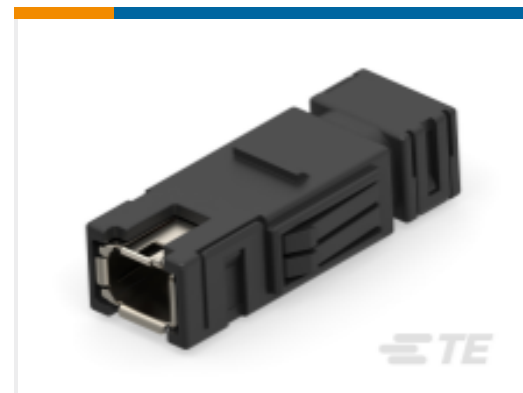
TE Part # 2201864-1 MINI I/O REC KIT TYPE I L