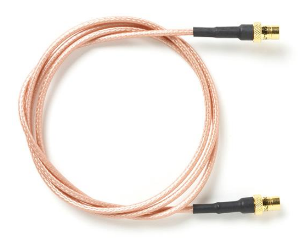
73072-VV SMB Jack to SMB Jack, RG179B/U, 75 Ohm

Cable is RG179B/U with length of 48" (1219mm)