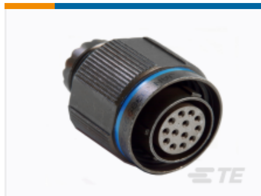
TE Part #YDTS26F25-37PBC001 PLUG ASSY