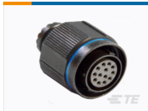
TE Part #YDTS26G17-35SNV001 PLUG ASSY