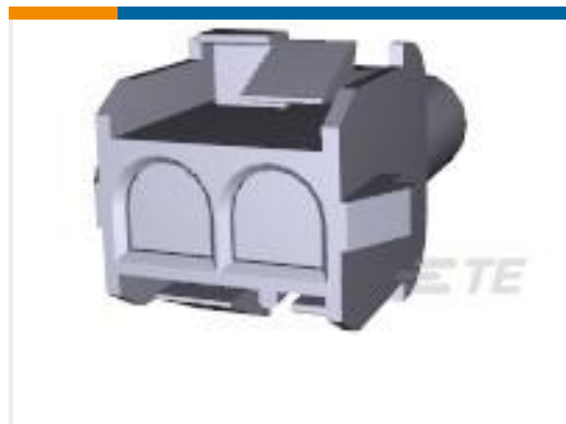
TE Part #1-480699-0 02P UMNL CAP HSG NATL