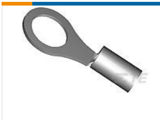
TE Part #322798 SOLIS R HR 22-16COM 22-18MIL 8