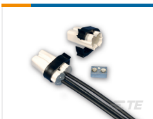
TE Part # CP1967-000 GELCAP-SL-2/0-3HOLE-B100