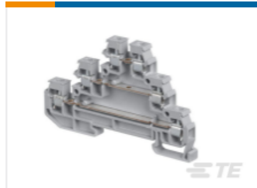
TE Part #1SNA115541R1100 D2.5/6.DA