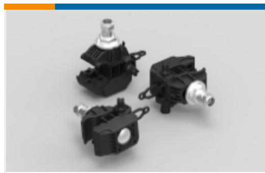
Street Lighting Connectors(2)