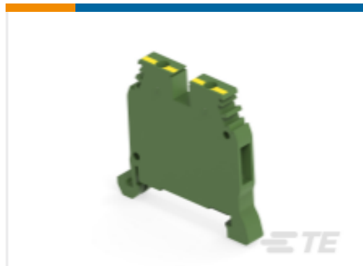
TE Part #1SNA165809R0100 D4/6.P