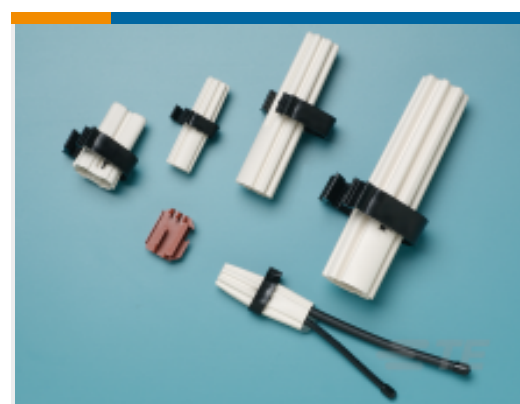
TE Part # 986734-000 GELCAP-2(B5)