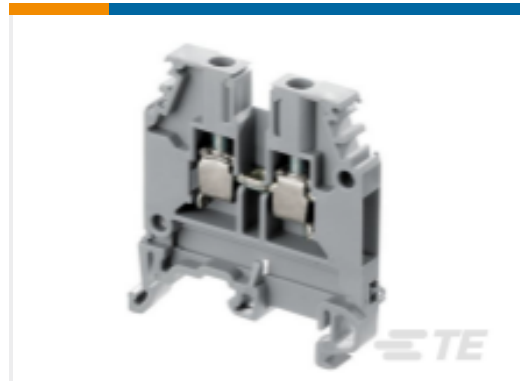
TE Part #1SNA105031R1400 M4/6