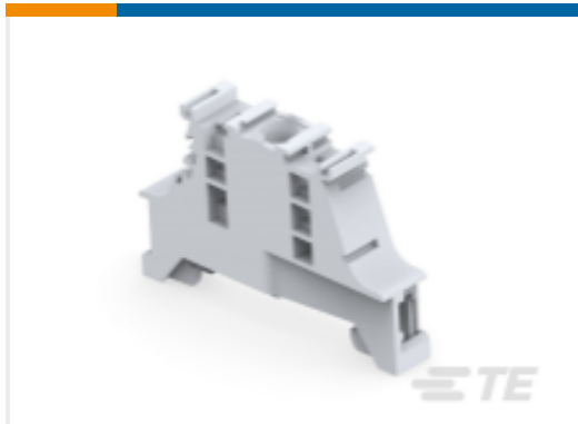
TE Part #1SNK900001R0000 BAM4