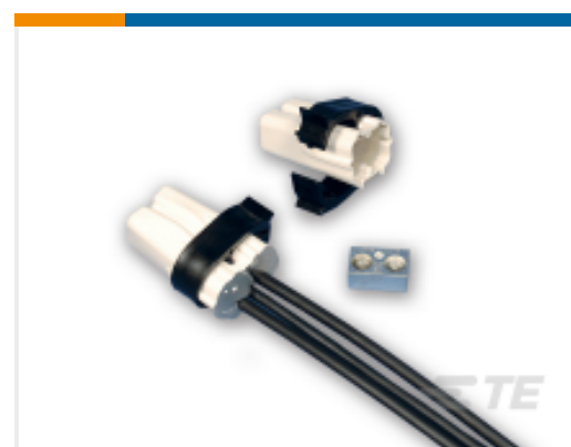
TE Part # F40658-000 GELCAP-SL-2/0-3HOLE(B10)