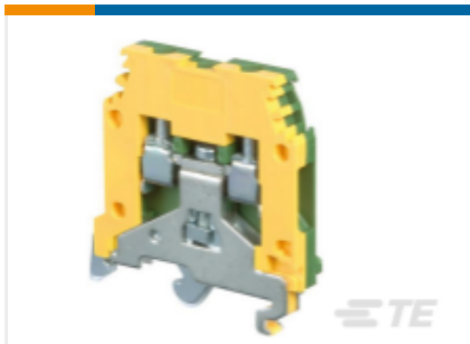
TE Part #1SNA165113R1600 M4/6.P