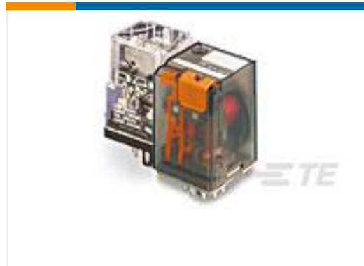
TE Part #2-1393104-5 KRPA-11AG-120=KRPA-