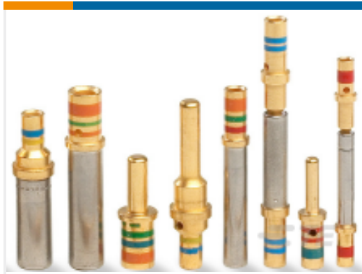
TE Part #38943-20L CONTACTS (=724-0007-20)