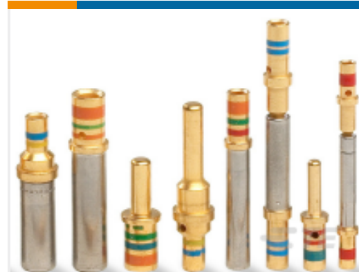
TE Part #38941-16 CONTACTS