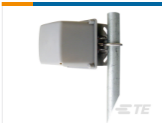
TE Part #MD24-12 Dir,Mini,Fixed,NF 2400-2485MHz, 11dBi,BW6