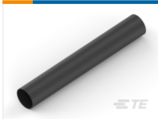
TE Part #NB25822001 SCL-1/8-0-STK