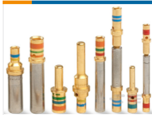
TE Part #38941-20L CONT PIN