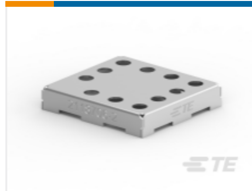
TE Part #2118706-2 1 PC STD SHIELD, CRS-13.66X12.70X2. 54MM