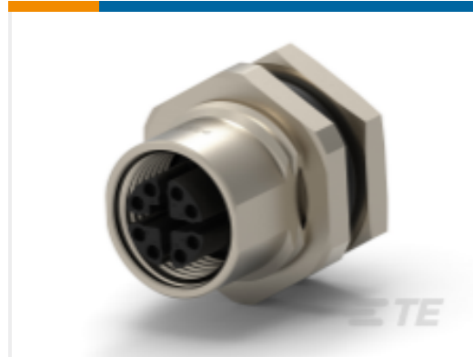
TE Part #2271195-1 RPC-M12X-FF-8CON-M16-LAU