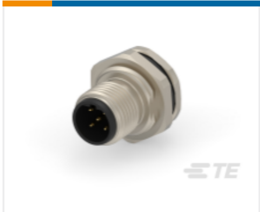
TE Part #T4171010405-001 M12,REAR MOUNTING,MALE,B,5P,0.2 M WIRE