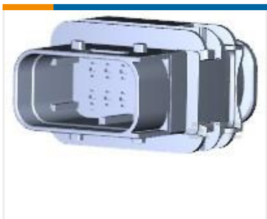
TE Part #1-1564516-1 10POS, MIXED,TAB HSG,ASSY