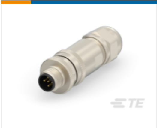
TE Part #T4111011051-000 M12 M, 5P GOLD A_CODE S SHIELDED PG7