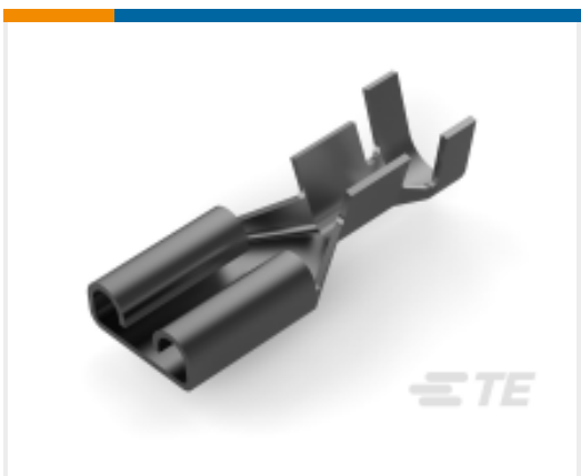
TE Part #5-160447-5 FF 250 REC 1.0-2.5MM2 PRBR LP