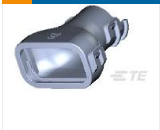
TE Part #1563111-1 COVER,180