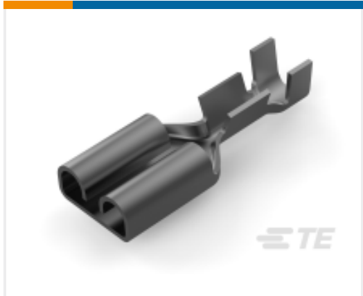
TE Part #5-160667-2 FF 250 REC 0.5-1.5MM2 TPBR LP