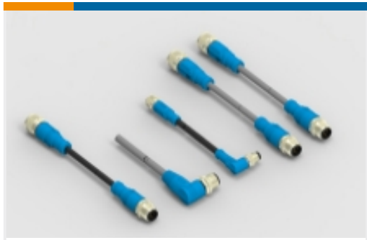
M8/M12 Cable Assemblies(230)