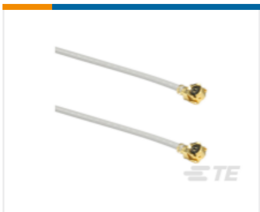
TE Part #CSI-UFFR-200-UFFR U.FL/MHF1 to U.FL/MHF1 200mm 1.13 OD