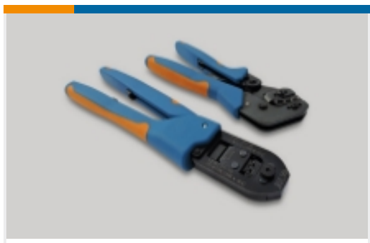
Hand Crimping Tools(32)