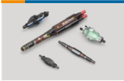
Joints & Splices(7)