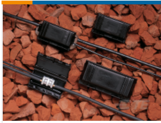
TE Part # 166533-000 GHFC-1-90(B100)