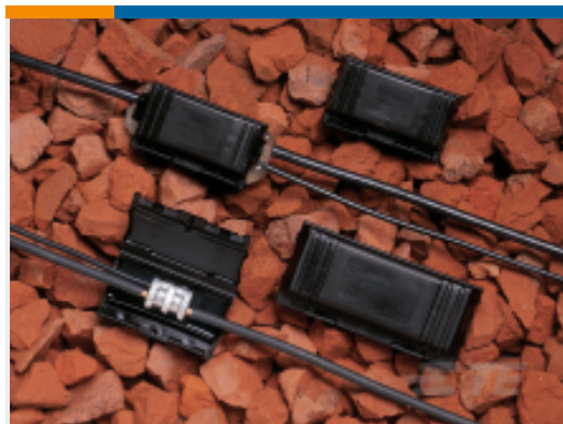
TE Part # 765669-000 GHFC-1-90(B10)