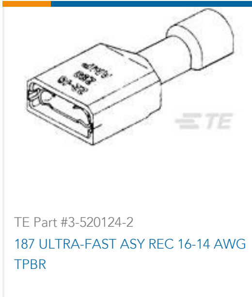
TE Part #3-520124-2 187 ULTRA-FAST ASY REC 16-14 AWG TPBR