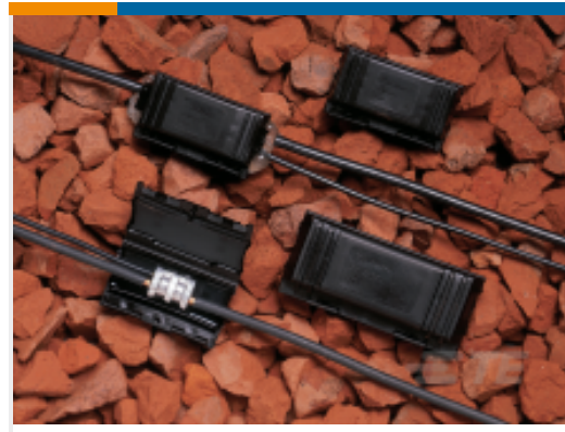
TE Part # 505941-000 GHFC-3-90(B6)