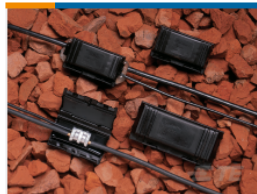
TE Part # 348333-000 GHFC-2-90(B100)