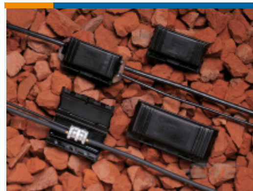
TE Part # C48562-000 GHFC-2.5-90(B300)