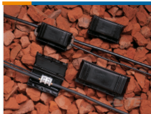
TE Part # 629995-000 GHFC-3-90(B18)