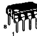
N SUFFIX PLASTIC PACKAGE CASE 626