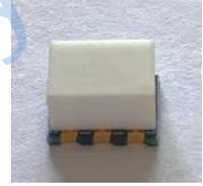
2 Way-0° 50Ω 5 to 500 MHz