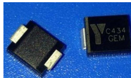
Molded plastic glass passivated junction.

The SMC series is designed to protect voltage sensitive components from high voltage, high energy transients. They have excellent clamping capability, high surge capability, low zener impedance and fast response time. The SMC series is supplied in YINT Semiconductor's exclusive, cost-effective, highly reliable and is ideally suited for use in communication systems, automotive, numerical controls, process controls, medical equipment, business machines, power supplies and many other industrial/consumer Applications.