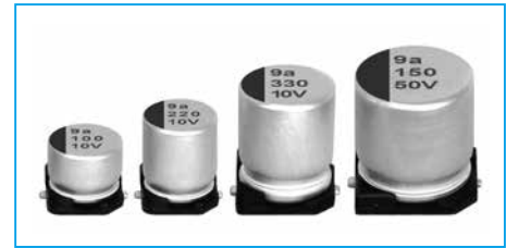
Marking color : Black print