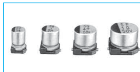
Marking color : Black print