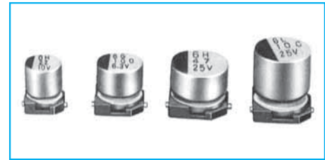
Marking color : Black print