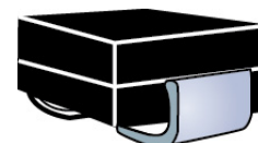
DO-214AA J-bend Package

NOTE: All SMB series are equivalent to prior SMS package identifications.