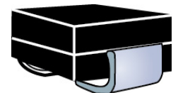
DO-214AA J-bend Package

NOTE: All SMB series are equivalent to prior SMS package identifications.