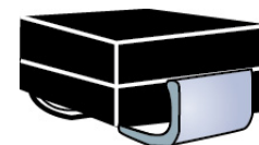
DO-214AA J-bend Package

NOTE: All SMB series are equivalent to prior SMS package identifications.