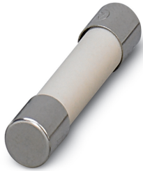
Output fuse (5x20 mm) acc. to IEC 127-2/EN 60127-2, 2 A fast blow

Please be informed that the data shown in this PDF Document is generated from our Online Catalog. Please find the complete data in the user's documentation. Our General Terms of Use for Downloads are valid ( http://phoenixcontact.com/download )