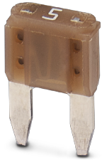
Fuse, nominal current: 5 A, length: 11.9 mm, width: 3.8 mm, height: 16.2 mm

Please be informed that the data shown in this PDF Document is generated from our Online Catalog. Please find the complete data in the user's documentation. Our General Terms of Use for Downloads are valid ( http://phoenixcontact.com/download )