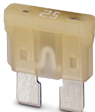
Fuse, nominal current: 25 A, length: 19 mm, width: 5 mm, height: 19.7 mm

Please be informed that the data shown in this PDF Document is generated from our Online Catalog. Please find the complete data in the user's documentation. Our General Terms of Use for Downloads are valid ( http://phoenixcontact.com/download )