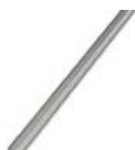
Continuous plug-in bridge, length: 500 mm, color: gray

Continuous plug-in bridge - FBST 500-PLC GY - 2966838