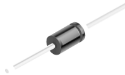
DO-35 Glass case