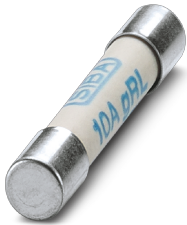
Fuse, nominal current: 10 A, length: 31.8 mm, diameter: 6.35 mm

Please be informed that the data shown in this PDF Document is generated from our Online Catalog. Please find the complete data in the user's documentation. Our General Terms of Use for Downloads are valid ( http://phoenixcontact.com/download )