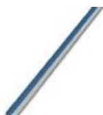
Continuous plug-in bridge, length: 500 mm, color: blue

Continuous plug-in bridge - FBST 500-PLC BU - 2966692