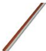
Continuous plug-in bridge, length: 500 mm, color: red

Continuous plug-in bridge - FBST 500-PLC RD - 2966786