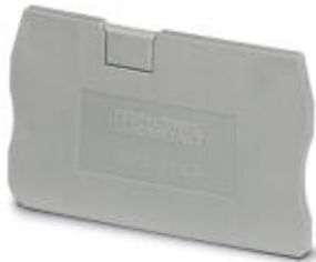
End cover, length: 48.6 mm, width: 2.2 mm, height: 29.1 mm, color: gray

Please be informed that the data shown in this PDF Document is generated from our Online Catalog. Please find the complete data in the user's documentation. Our General Terms of Use for Downloads are valid ( http://phoenixcontact.com/download )