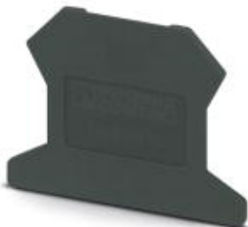
盖，长度: 42.5 mm，宽度: 1.5 mm，高度: 30.7 mm，颜色: 深灰色

Please be informed that the data shown in this PDF Document is generated from our Online Catalog. Please find the complete data in the user's documentation. Our General Terms of Use for Downloads are valid ( http://download.phoenixcontact.com )